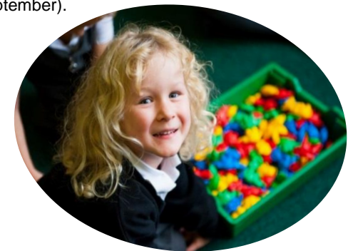
'I love my school' – year 2 pupil

Our year 1 pupils arrive at school at 8:50 and enter through the year 1 door. They will have break from 10:30 – 10:45 and lunch from 12:15 – 1 pm each day. They will leave for home at 2 pm each day (excluding September).